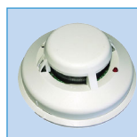
(127mm dia x 51mm)

Residential and Small Commercial Solutions